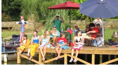
Boat Parade Judges