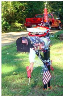
1st Place - $25 Cobbs Family