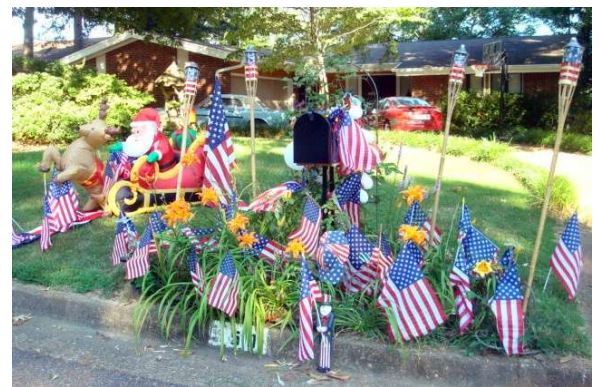
Mailboxes worth mentioning