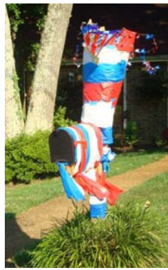
2nd Place - $15 Christenson Family