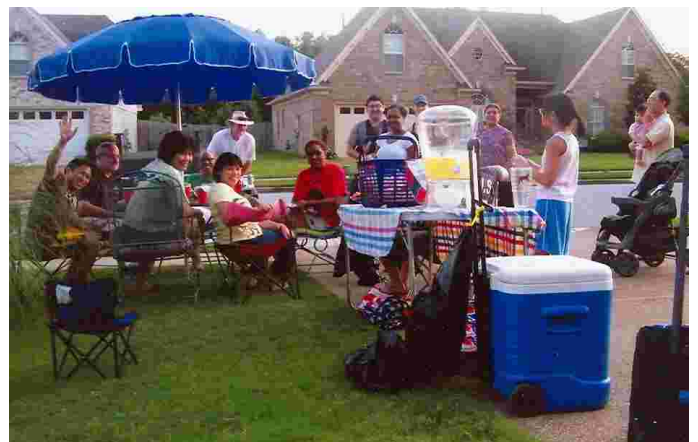
National Night Out August 4, 2009 on Trondheim Dr.